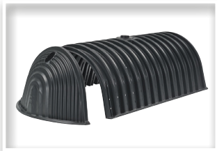
DRAINMAX tunnel trench