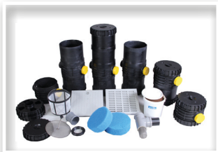
PLURAFIT chamber & filter kit