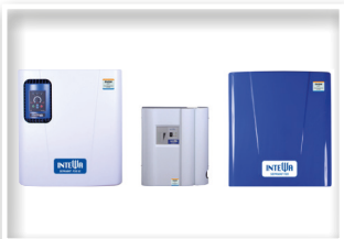
SEPAMAT system separators