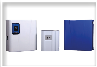
RAINMASTER control units