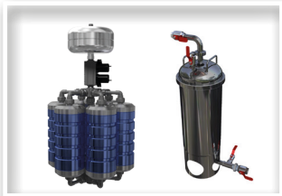
AQUALOOP installation kit for water treatment